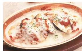
Meat Sauce & Eggplant Gratin

Pepperoni, bacon, spicy ground beef and sausage