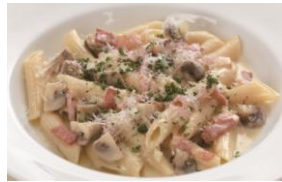
Mushroom & Bacon Gorgonzola