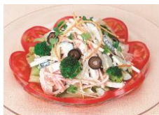
Oriental Chicken Salad