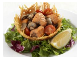
Salmon Mushroom Salad