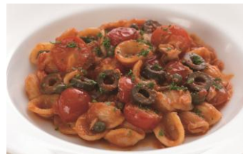
Conchiglie alla Puttanesca