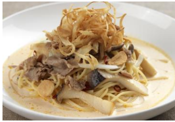
Pork & Eryngii Spicy Cream