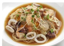
Seafood Pietro Style