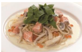
Salmon & Eryngii Wasabi