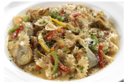
Artichoke & Ground Beef