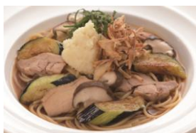
Chicken & Eggplant