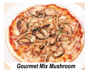
Gourmet Mix Mushroom

Tuna, Shrimp, Squid, Scallop, Spicy Ground Beef, Shiitake Mushroom, Enoki Mushroom