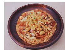
Bacon & Mushroom