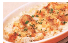
Shrimp Mushroom Doria