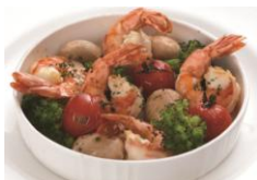
Baked Garlic Shrimp