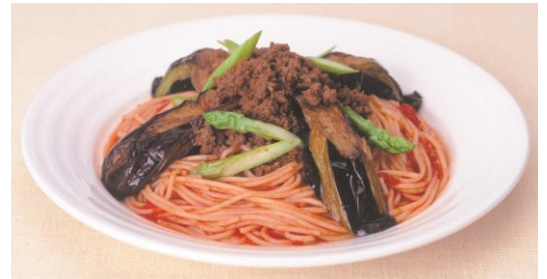
Eggplant & spicy groundbeef