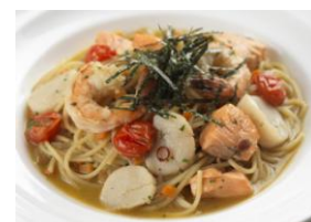
Seafood Peperoncini Wasabi