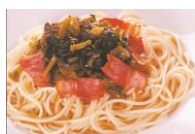
Takana & Bacon

New Chicken & Eggplant Ginger-Orosi Sauce .....$11.95 Chicken & eggplant in a shoyu dashi sauce topped with ground ginger & daikon, shiso-leaves & fried onion