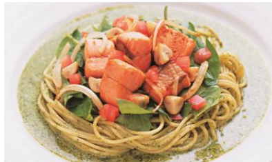
Salmon & Spinach Basil Cream