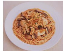
Chicken & Mushroom

Seafood & Other $3.00 each Shrimp, Squid, Scallop, Clams, Takana, Spicy Ground Beef, Pesto, Shiitake Mushroom, Enoki Mushroom, Eryngii Mushroom